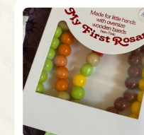
My 1 st Rosary

And more. Please ask for assistance from any Altar and Rosary member.