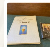
1st Communion Books