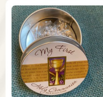
1st Communion Rosary