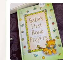
Baby Prayer Book